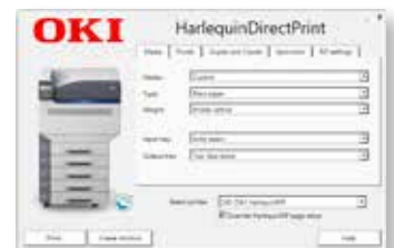
Harlequin MultiRIP 10