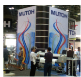
Trade Show Displays