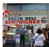
Point of Purchase